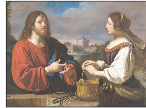
Artwork by Guercino Giovanni Francesco Barbieri Italian 1591 1666